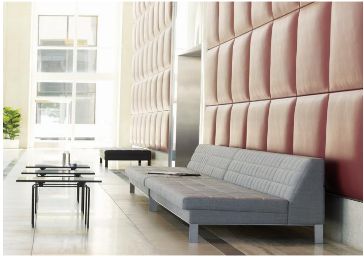
Millbrae Contract lounge shown with Millbrae occasional tables

Millbrae occasional tables complement the lounge seating offering with a coordinating steel frame available in brushed nickel or black gloss powder coated finishes. They come in various sizes in square and rectangle shapes, and the tops are available in 10 glass colors and ubatuba granite. The beautiful table structure creates a stunning visual as a stand-alone piece.